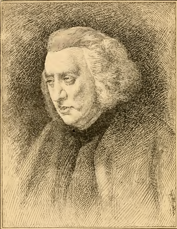
SAMUEL JOHNSON, LL.D.

From a photograph of the painting by John Opie, R.A., in the National Portrait Gallery